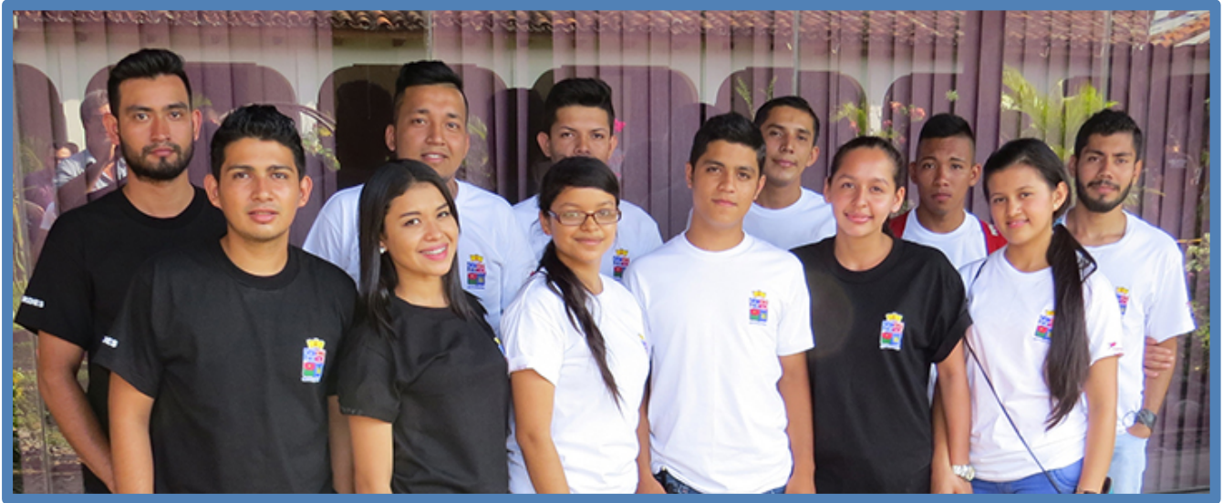
El Salvador Projects participating students, 2016