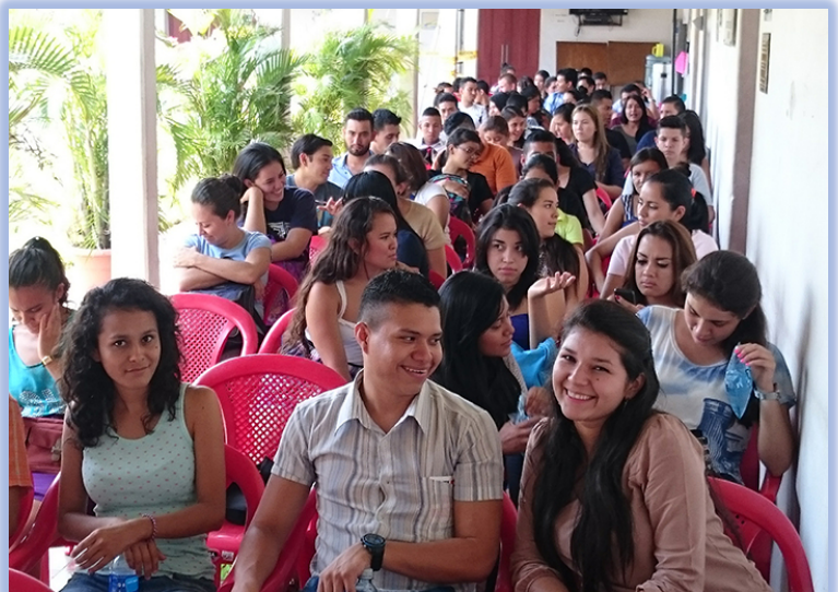
Student Meeting, March