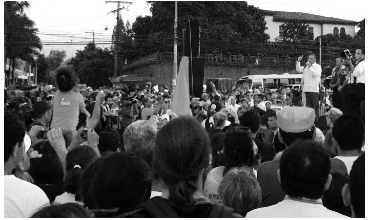
President Mauricio Funes, right, addresses the crowd