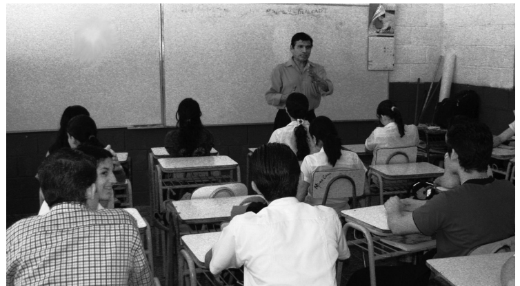
Bachillerato (high school) class at the El Barío School, 2009

Clerk of Palo Alto Friends El Salvador Projects