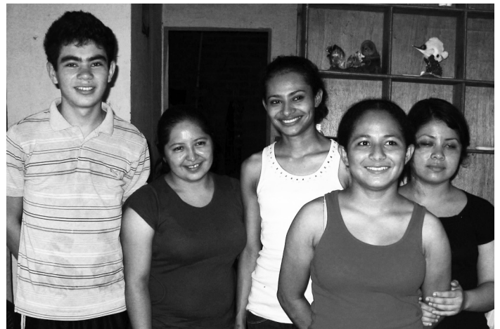
This year's university students in San Miguel, in the student house.