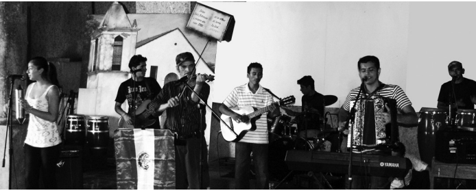
Los Torogoces de Morazán music group singing songs of struggle.