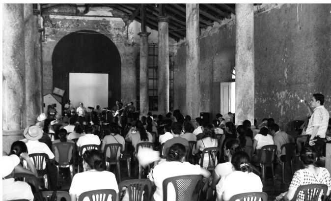
Participants in the capilla of the Art Center for Peace

It brought a deeply emotional response from the more than 175 Salvadorans who watched silently with rapt attention in the high-ceilinged chapel of the Art Center for Peace in Suchitoto, site of the conmemoración – the gathering to commemorate the twentieth anniversary of Quaker Projects in El Salvador. Participants had come from many parts of the country, from the four communities where