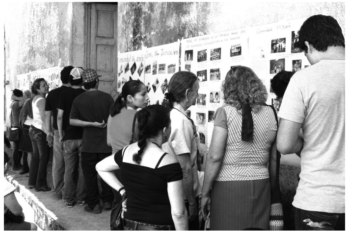
Viewing the wall displays at the conmemoración