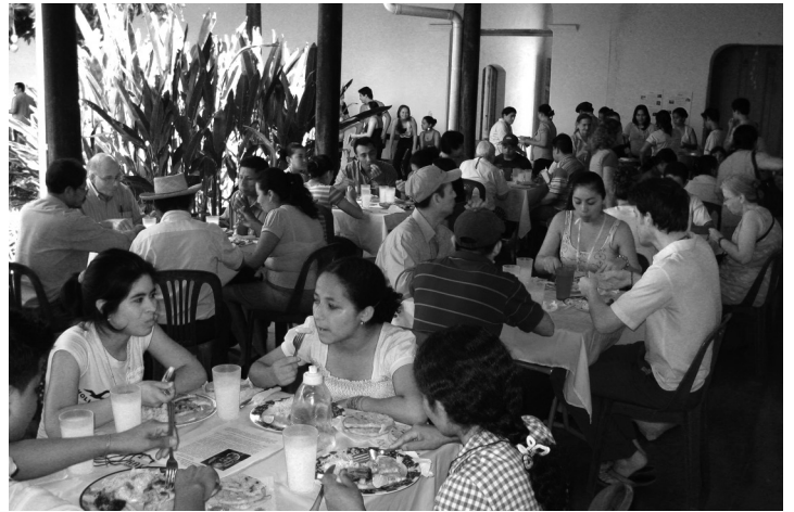
Conmemoración lunch in the Centro Arte para la Paz