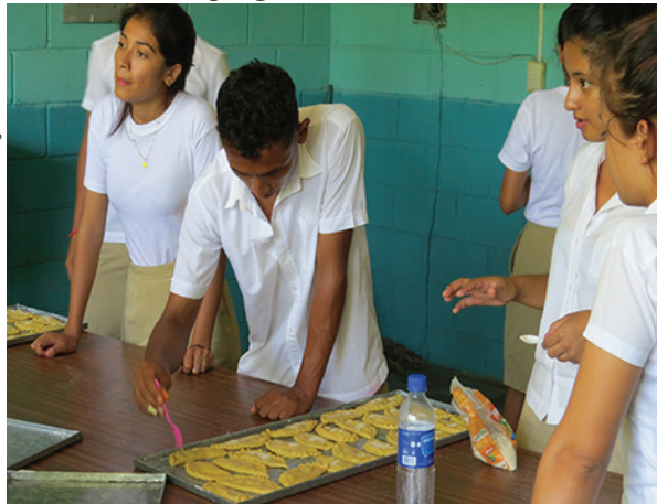
The baking program