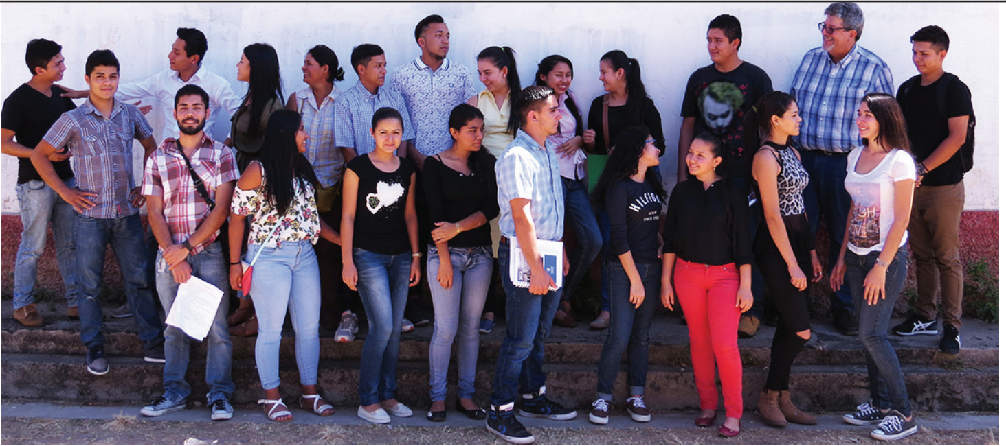
Our 2018 University Students