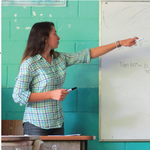
high school tutoring

their studies. The classes are being taught by some professional teachers, as well as some current and past scholarship students. With support from the new scholarship youth association, ABE-SUCHI, I hope to expand the program to the other 4 rural K-12 schools in Suchitoto in 2019. We should be able to measure the effect of our project through results of the annual high school exit exam given in October to all graduating high school students. One of our supporters was so inspired by last year's social work projects that he donated funds specifically for projects of this kind. Part of his donation will be used to pay travel expense for some of our teachers. Because the experience with social work projects was successful in 2017, this year we have implemented the program with all of the students in our student house. This was made easier because the Santa Cruz al Salvador program had also decided to have their students