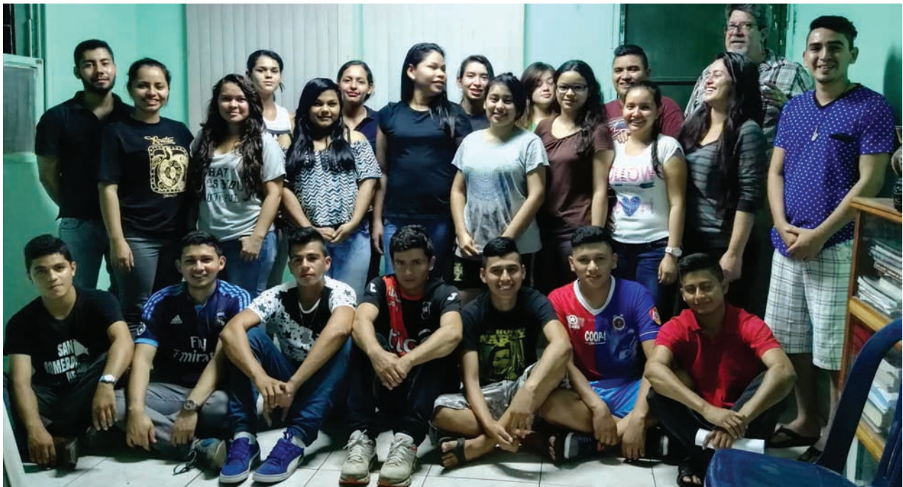
Students living in the student house