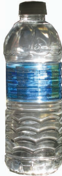
The Bottled water victory

allowed a modest expansion of our expected budget. A few examples will illustrate how much this means to the students and their families.