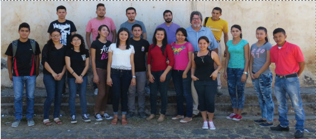
Our Students' First Meeting, February 2017